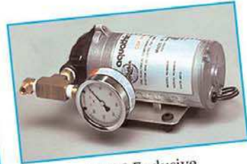
Aqualithin's® Exclusive Optional "Zero Noise Platinum Booster Pump".

AQUATHIN® lites the way into the future of Water Purification with the AQUALITE™. The AQUALITE™ Water Purification System is comprised of three patents to give you the most effective and efficient water treatment system in the universe -- we Golden guarantee it! NO ONE DOES IT BETTER.